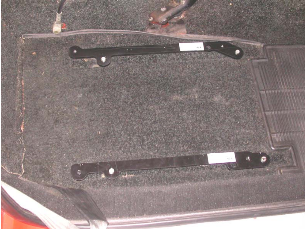
Passenger floorboard area with adapter plates installed.

Optionally, when installing the adapter plates, you can also cut away the carpet from underneath plates for a small measure of added legroom. Most will find this unnecessary however as Miata seats will give you about an inch more room underneath the steering wheel compared to a stock MGB seat.