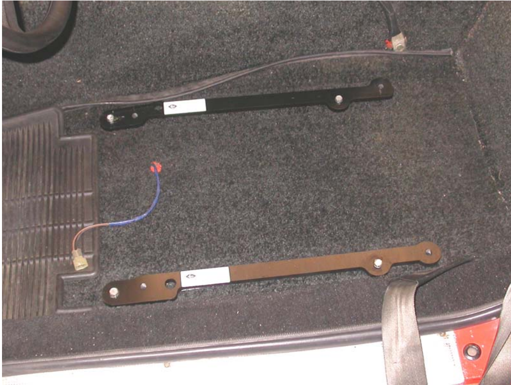
Driver's side floorboard area with seat adapter plates installed. Note the bolts going down through to the floorboard's captured nuts.